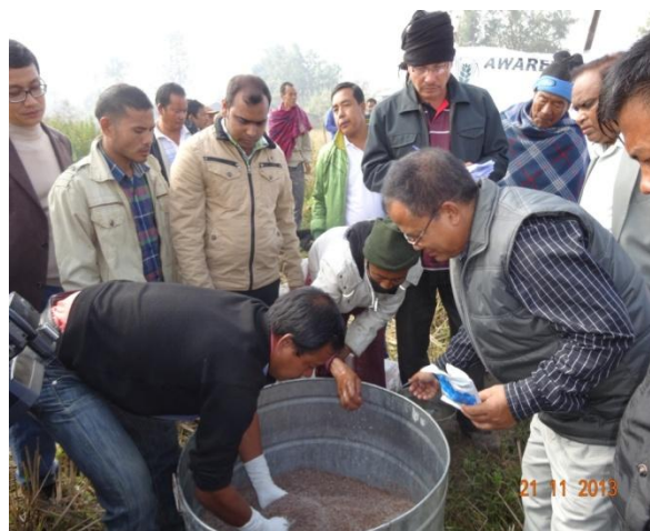
Demonstration of sowing of lentil with zero till and Seed treatment by the farmers