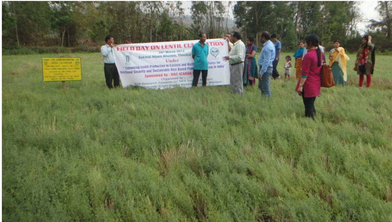
Field day organized at Sekmai Hijam Khumou (Interaction with farmers)