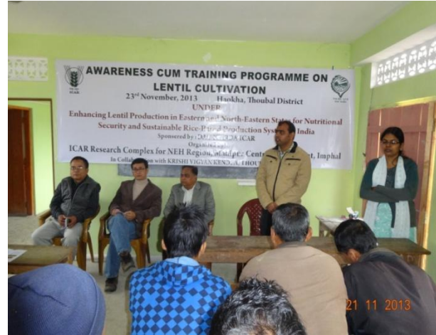
Organized training programme in Hoakha and Ngairangbam village