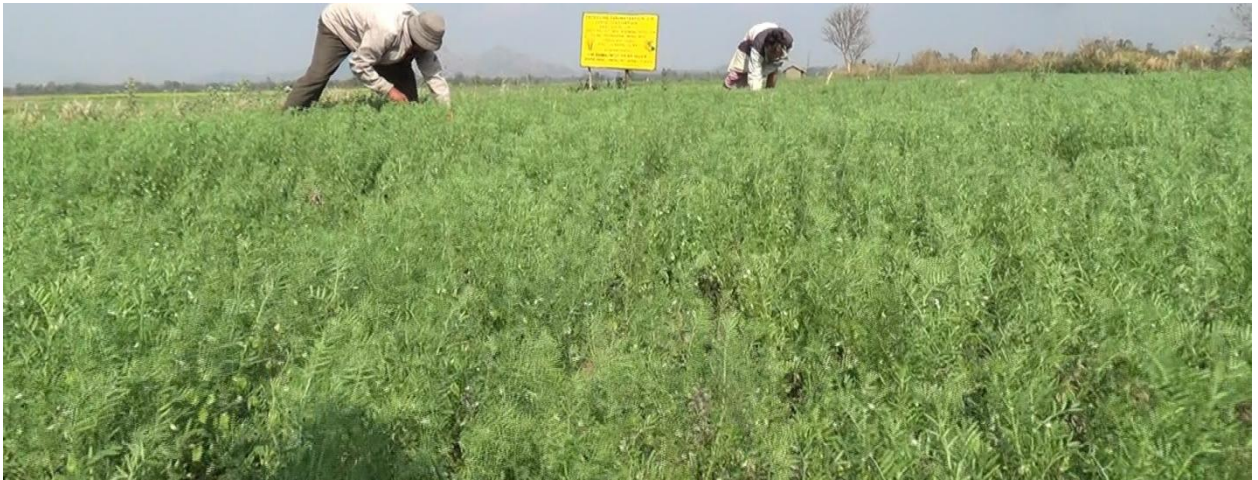
Demonstrated Lentil (HUL-57) under Zero tillage at Sekmai Hijam Khunou village, Thoubal and Ngairangbam village, Imphal (West)