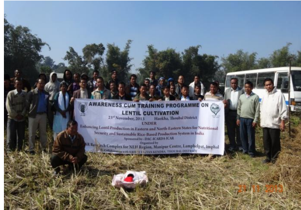
Awareness programme on zero till cultivation (Seeds and fertilizer putting by the farmers in Zero till)